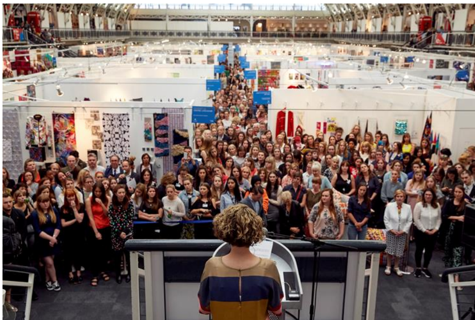
New Designers 2017 Awards Ceremony.

Joining long-standing New Designers supporters such as John Lewis, Wilko, Joules, Virgin Atlantic and Hallmark – which this year celebrates its 20th anniversary at the event – is a fresh crop of sponsors who are looking to New Designers to recruit upcoming design talent and inject fresh thinking into their businesses. These include the toy masters of LEGO , assistive technology company Stannah and luxury hospitality group, Belmond .