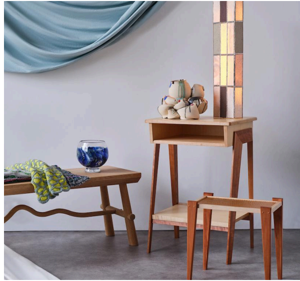
Above: ND Selects 2024