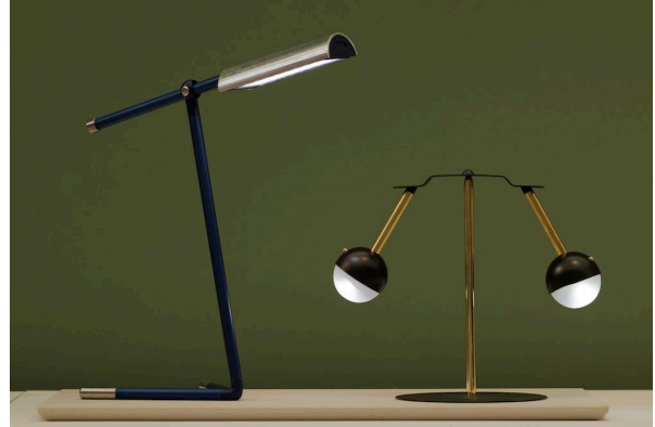
Above: New Designers 2023

Other key aspects of the show to look out for include: