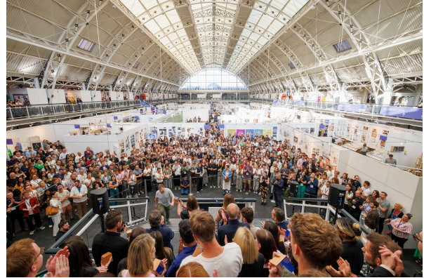
Above: New Designers 2023

Also at the heart of New Designers every year is ND Awards – a series of exciting accolades where leading design brands and businesses select and award the rising stars of tomorrow for their creative and forward-thinking work in response to some of the current trending topics; from sustainability and mental wellbeing to diversity and inclusivity in the design world.