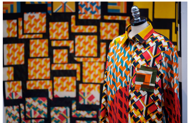
Above: New Designers 2023