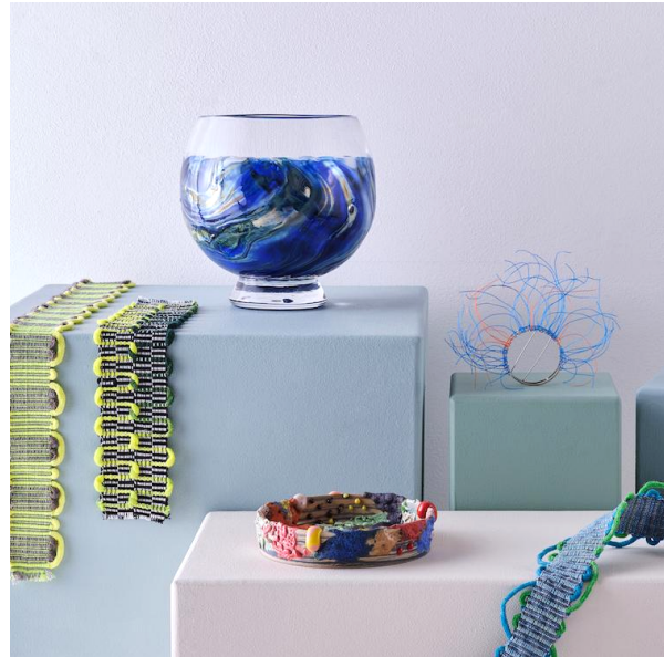
Above: ND Selects 2024

New Designers will return to the Business Design Centre, London, from 26 – 29 June and 3 – 6 July 2024 ( tickets available now ). The show, now in its 39 th year, will once again celebrate the best emerging talent by bringing together 3,000 design graduates from over 100 university courses under one roof across the following disciplines: