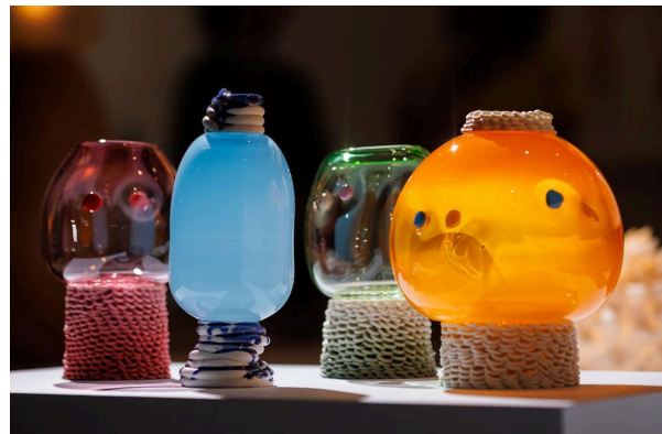
Above: New Designers 2023